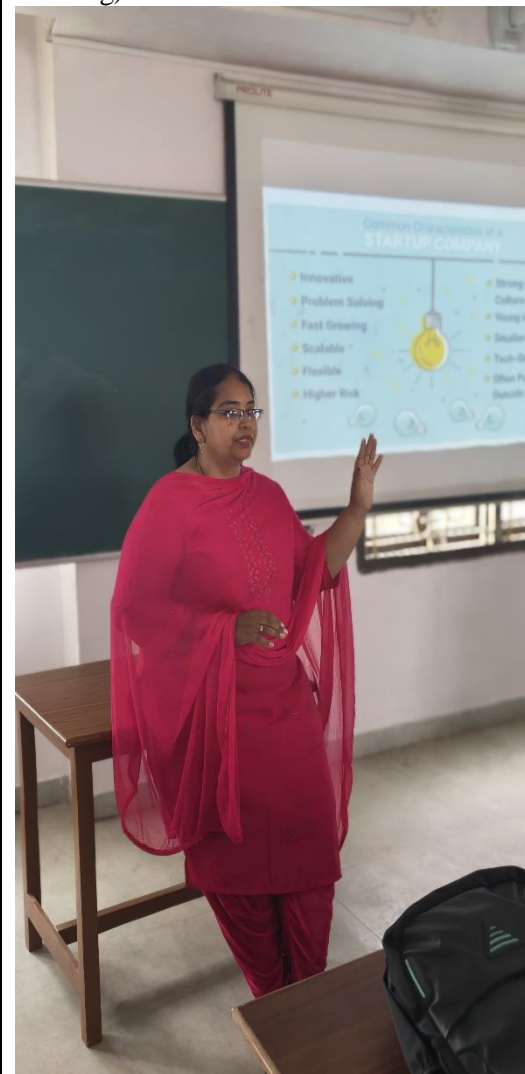
four Photographs/Screenshots that show the participation of students and Staffs(Teaching/Non-teaching)