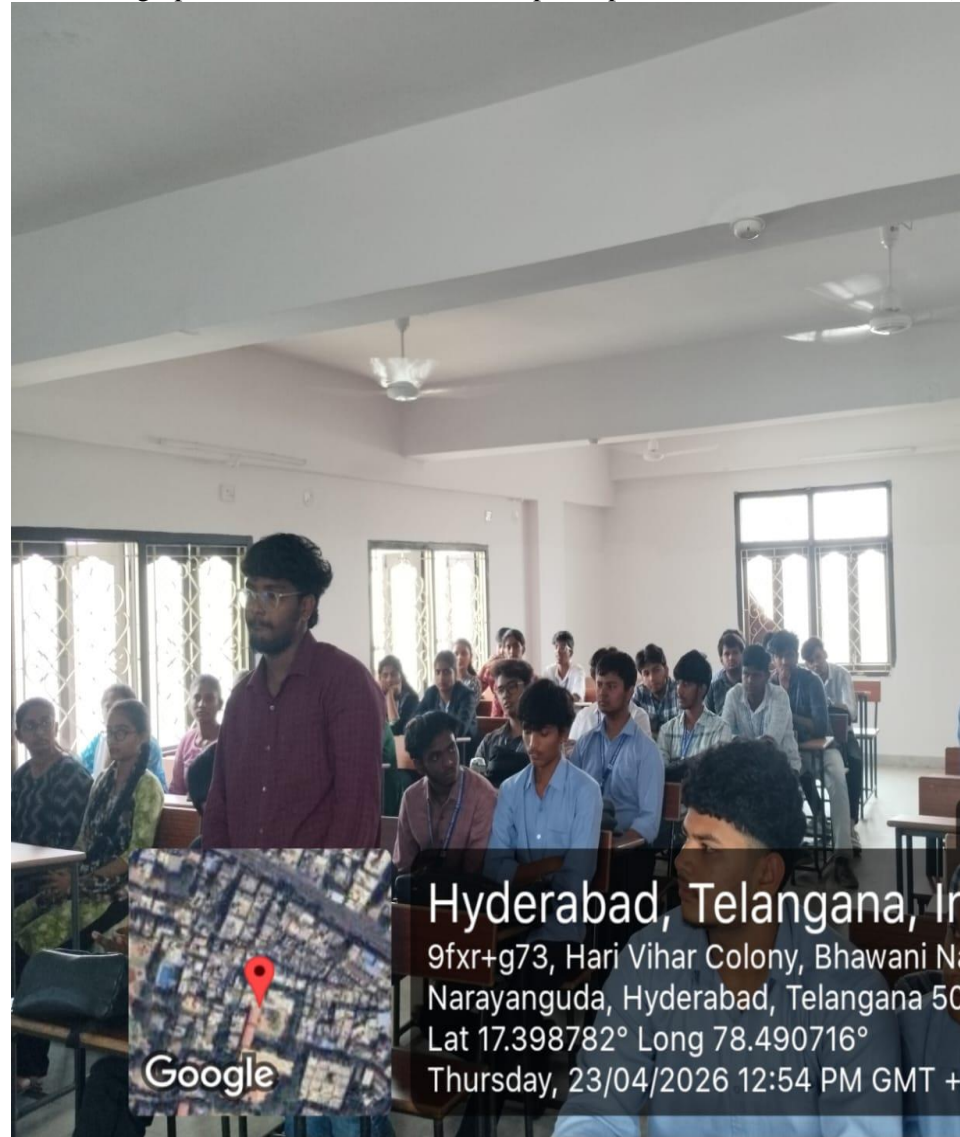
four Photographs/Screenshots that show the participation of students and Staffs(T